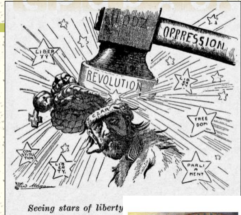
Seeing stars of liberty